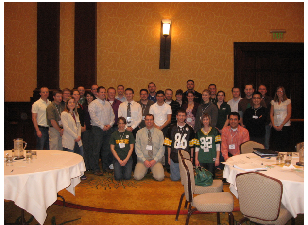
Multi-Region Leadership Conference