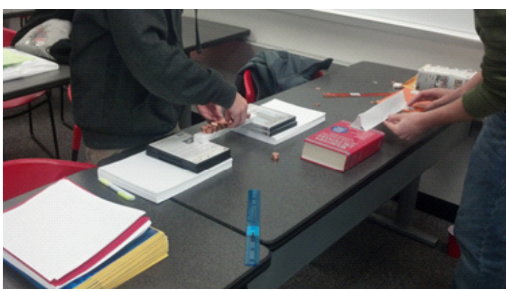
Bridge building activity at the PKI open house