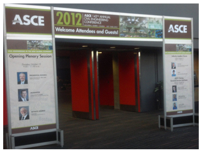
ASCE 142nd Annual Civil Engineering Conference