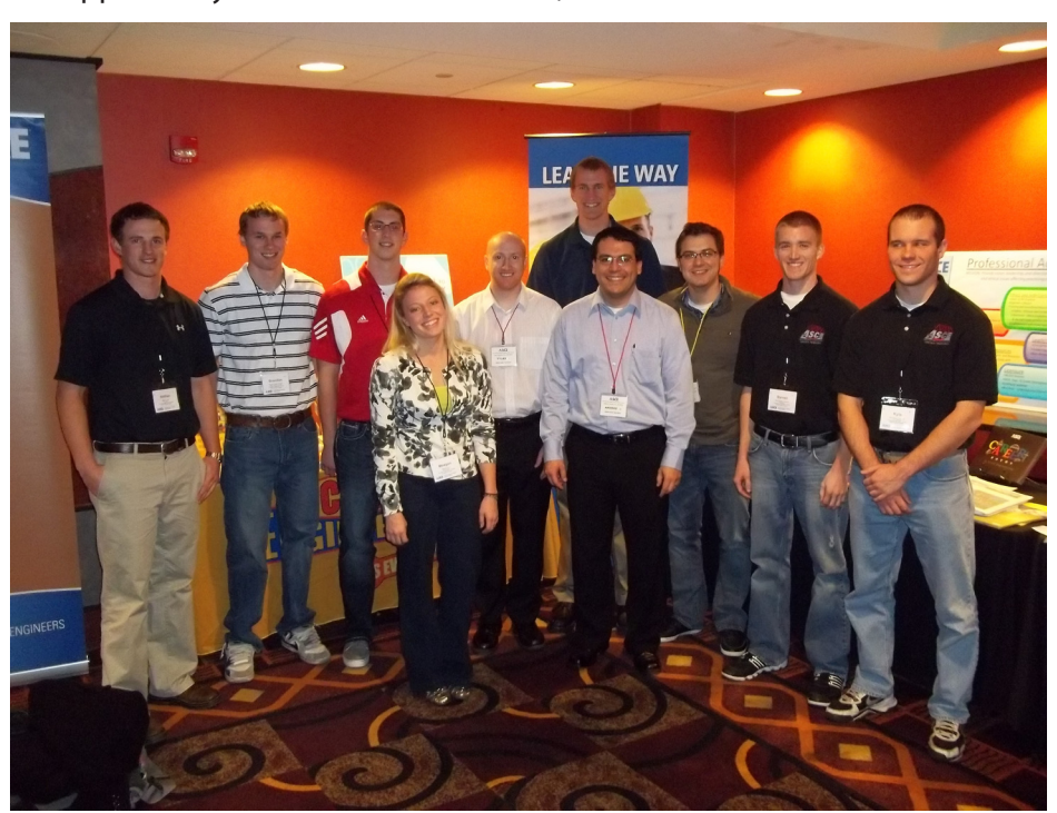
NEASCE Members and Student Members at the Multi Region Leadership Conference

This Leadership Conference was a wonderful opportunity to gain a better understanding of ASCE, to become familiar with the present and future of the Society, and to discover ways to get more involved with ASCE. The conference also provided attendees the opportunity to meet other members, share ideas and reconnect with old friends.